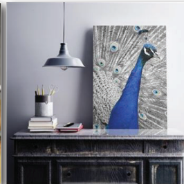
Canvas Photo (variety of sizes)