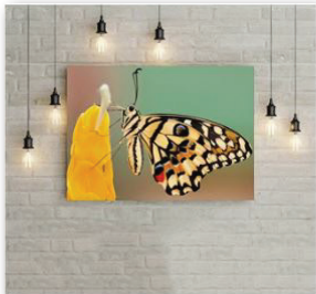
Metal Wall Prints