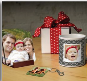
Personalized Gifts Mugs/Bottles, Koozies, Coasters, Keychains, etc.