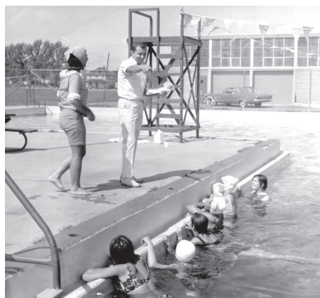
Photo - 1965 Swimming tests are taking place.