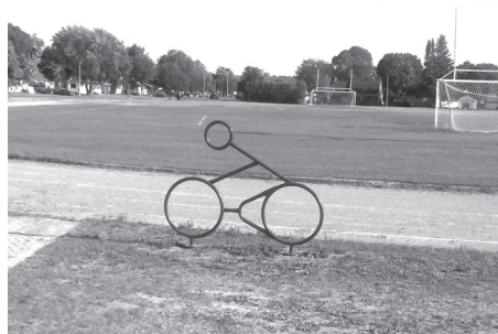
Photo: More colourful bike stands such as this one are needed in Espanola to ensure bike security. A study shows this as a real need.

By Rosalind Russell - The Town of Espanola is working on their first cycling plan, and the work that has been done so far shows broad support for it in Espanola.