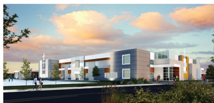
3D PERSPECTIVE RENDERINGS PERSPECTIVES VISUELLES 3D