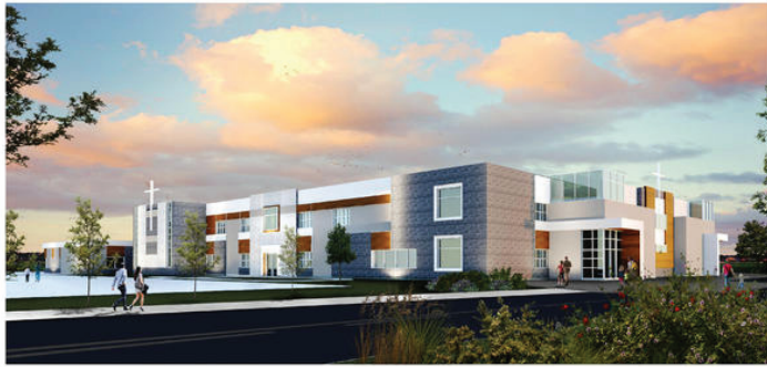
3D PERSPECTIVE RENDERINGS PERSPECTIVES VISUELLES 3D

IDEA INTEGRATED DESIGN ENGINEERING + ARCHITECTURE