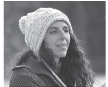
Photo: This year's Lobsterfest will help a Massey woman and her family.