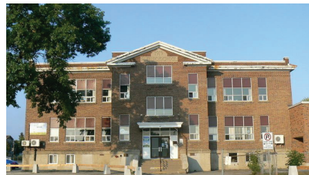
Sacred Heart Public School may be saved depending on various parties coming together to strategize and plan.