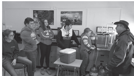
Photo: Ecole Franco-Ouest will be busy on their return from holidays taking care of some 15,000 trout eggs. The students will take care of them until they hatch and then release them in local waterways when they reach fingerling size, sometime in early Spring.

By Rosalind Russell - Students at Ecole Franco-Ouest in Espanola will be busy in the New Year with some 15,000 new residents.