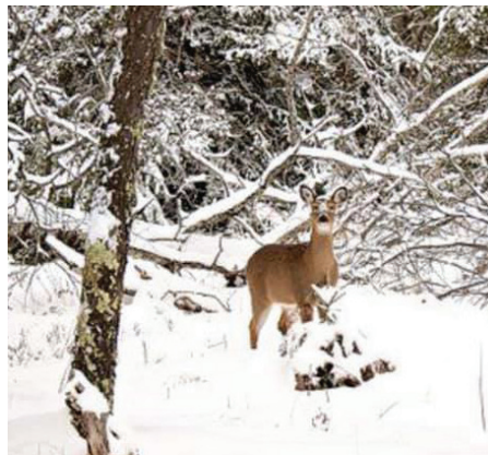
PHOTO: The deer need help this year due to the aggressive winter weather that has trapped deer and made it difficult to feed.

The deer are starving and a local game and fish member says deer are dying in droves because of the harsh winter conditions.