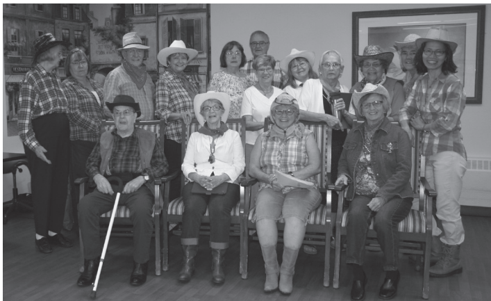
Photo: The Sunshine Singers love to entertain, especially seniors at the Long-Term Care Residence at the Espanola Regional Hospital & Health Centre, as well as at the Seniors Drop-in Centre in Espanola.