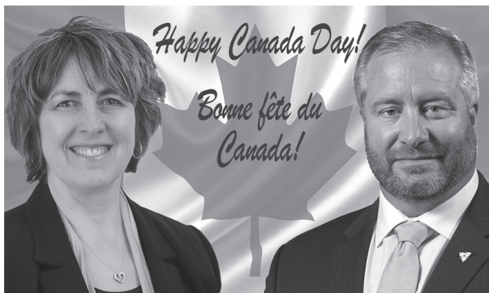
Carol Hughes, MP/députée Algoma-Manitoulin-Kapuskasing carol.hughes@parl.gc.ca