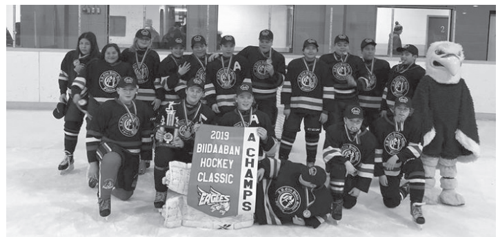
Photo: AB Ellis Public School in Espanola is this year's champion of the Biidaaban Hockey Classic.

Every year, elementary school students get together for the Biidaaban Hockey Classic. Hosted by Biidaaban School in Sagamok Anishnawbek First Nation, school teams