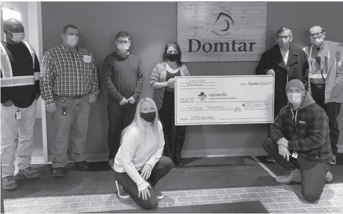
Photo - The Domtar Mill in Espanola officially kicked off the 9th Annual Christmas Radiothon for the Espanola Regional Hospital Foundation with a $15,000 donation presented on Monday, November 23rd.

Elliot Lake and Espanola Moose stations joined their other sister stations across Northeastern Ontario in radiothons to help a variety of charitable causes.