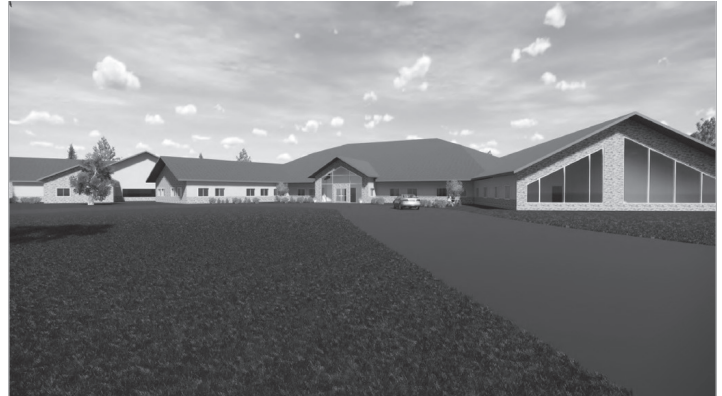
PHOTO: The design plans for a new nursing home in Wiikwemikoong on Manitoulin Island has been finalized and the process for funding is beginning. The board of the Wiikwemikoong Nursing Home wants to expand from 59 to 96 beds in a new facility.

A Manitoulin Island First Nation plans to increase its beds for a long-term care facility.