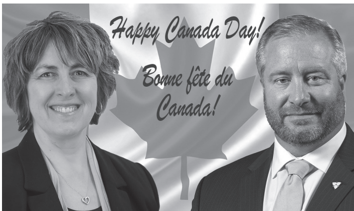
Carol Hughes, MP/députée Algoma-Manitoulin-Kapuskaing carol.hughes@parl.gc.ca

The township has installed signage indicating the rules that physical distancing must be maintained, no more than ten people grouping at a time and hand sanitizing.