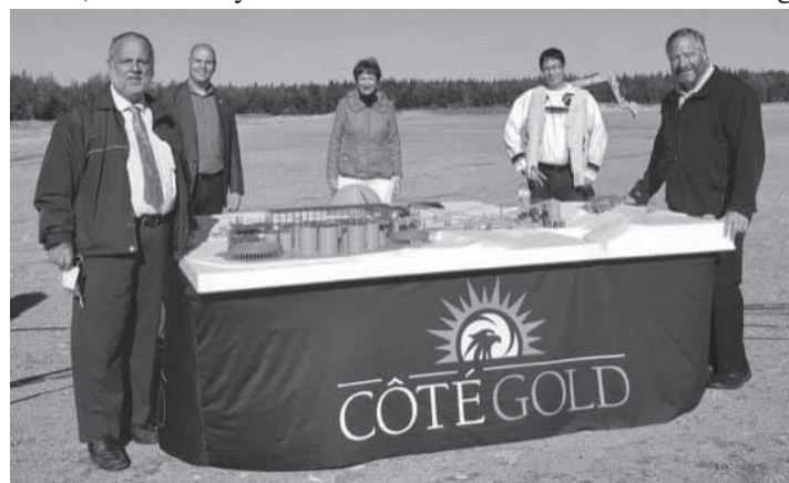
Local mayors and leaders.

IAMGOLD's website says that the Côté Gold Project is located approximately 20 km southwest of Gogama, 130 km southwest of Timmins, and 200 km northwest of Sudbury, roughly 5 km west of Highway 144.