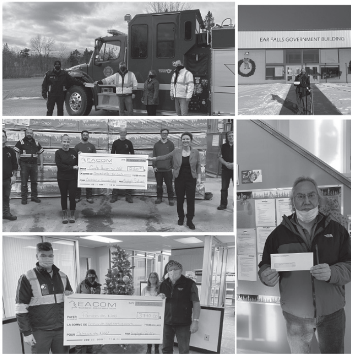
PHOTO: This year, EACOM employees have chosen to donate money usually spent on our holiday get-togethers to spread up some good cheer in their communities. In total, they gave around $25,000 to the local organizations and foodbanks of their choosing.