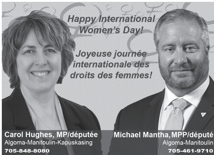
Carol Hughes, MP/députée Algoma-Manitoulin-Kapuskasing 705-848-8080