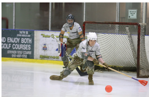
Photo: Want to play broomball? Come and check it out at the Espanola Regional Recreation Complex.

An Espanola man would like to see if there are people interested in playing broomball in Espanola.