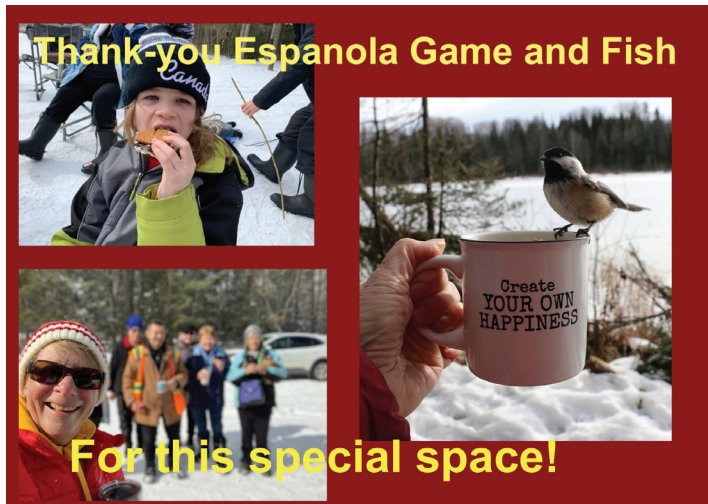
Photo - The Black Creek Sno-Trail continues to be a big attraction and thanks to a $2,500 grant from the OFAH, will see more improvements.

The Ontario Federation of Anglers and Hunters has provided a grant to make improvements in the Black Creek area in Espanola.