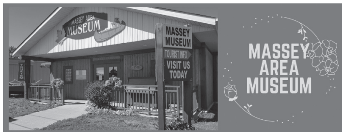
Photo - The Massey Area Museum is open for the spring season. They have a scavenger season underway. Check it out on the Facebook! https://www.facebook.com/masseyareamuseum .

The Massey Area Museum has opened its doors for another season and Timber Village Museum in Blind River is preparing to reopen.