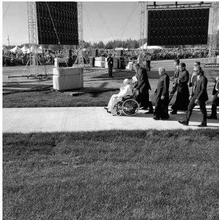
Photo: Pope Francis arrives at Lac Ste. Anne, a shrine that is of importance to Indigenous peoples in Canada.