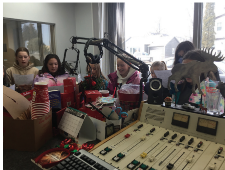
Photo - Sacred Heart visited the studio for the first time in three years lending the radiothon their musical talents.