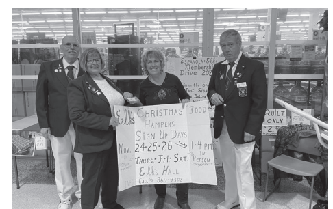
Photo: The Espanola Elks Hamper Fund was just one of several activities held over the weekend. Here is Algoma-Manitowlin-Kapuskasing MP Carol Hughes donating to the cause.