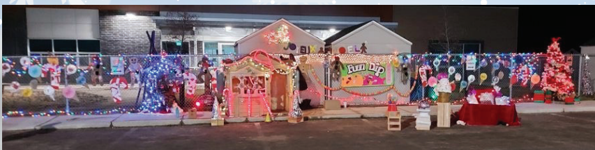
JUDGES CHOICE Our Children Our Future