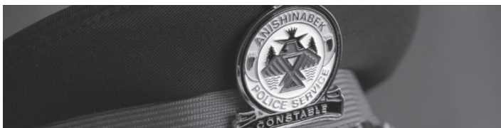
Photo: First Nations across Ontario are receiving funding for new technology, as well as mobile workstations, body cameras and automated license plate readers.

The Anishinabek Police Service is receiving just over 1.1-million dollars from the province for modernization projects.