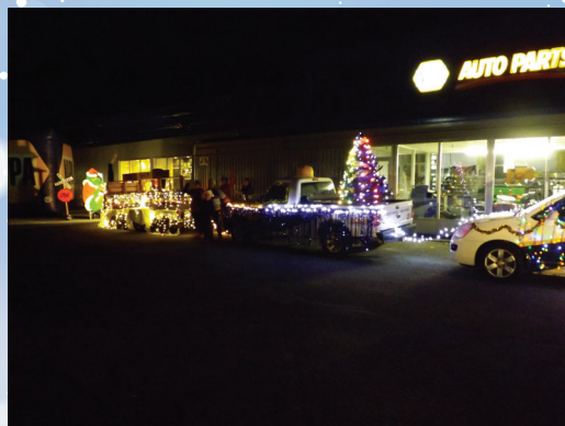
BEST BUSINESS NAPA