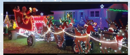
KNIIGHT CRUIZERS CAR CLUB & SANTA