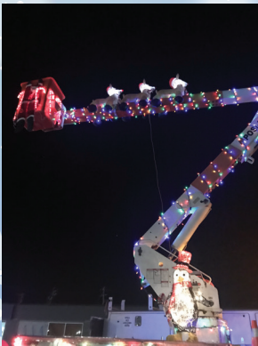
BEST BUSINESS TN Tree Services

Thanks to all the parade participants for spreading cheer & holiday spirit! A special thanks to the Knight Cruisers Car Club for bringing Santa to town!