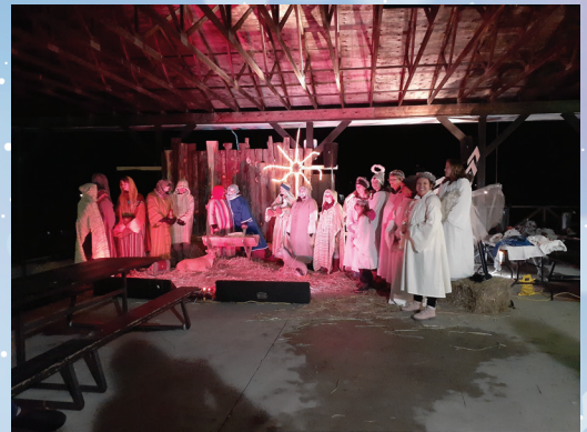
COMMUNITY SPIRIT Churches of Espanola