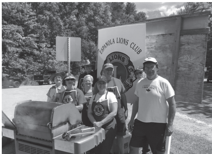
Photo - The Espanola Lions Club held A free BBQ at the boat launch to cheer on the DUCKS. There were no duck injuries but a few may be homeless for awhile! Thanks to the community for your of our TV Bingo and Catch the Ace.....without your support we could not do what we do. Photo by Grant Lewis used with permission.