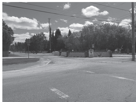
Photo - Most of phase one was carried out last year to install the new main trunk line from the water treatment plant to the intersection of Queensway Avenue and Mead Boulevard, seen here. The work continues into phase two, which will include sewer installation. Photo by Rosalind Russell

The Town of Espanola has resumed phase two of the main water trunk line from the water treatment plant to the water storage