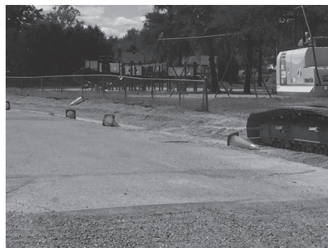
Photo - Construction of Espanola's new splash pad is well underway with a deadline of July 1st for a grand opening.

The construction of Espanola's latest recreation project is now underway.