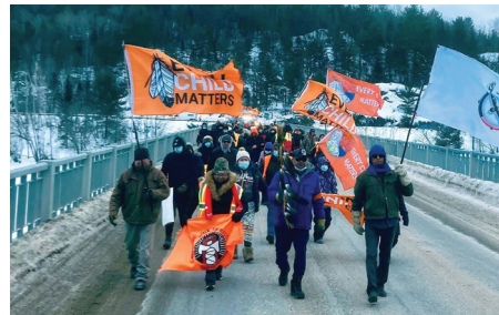
Photo - Community members from Sagamok-Anishinabek First Nation and Massey walked together as part of the Walk for Reconciliation.