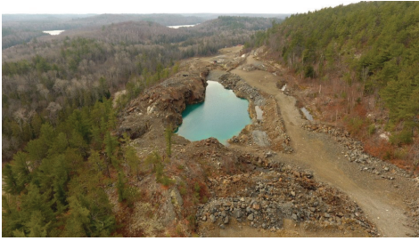
Photo - The West Pit on the Shakespeare Mining Site - 2020. If mine owners find the capital, the mine just outside of Webbwood could be reopened.

memorandum of understanding with Mitsui, where Mitsui would provide $10 million for a percentage of around 12% of the company.