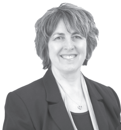
Carol Hughes, MP Algoma-Manitoulin-Kapuskasing

With the announcement that the Emergencies Act has been officially repealed, Carol Hughes, MP for Algoma-Manitoulin-Kapuskasing, believes that the act has done its job.