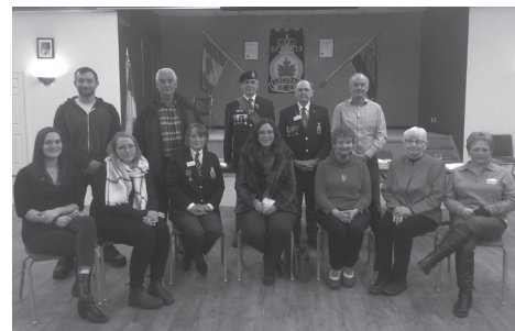
Photo: The new guard was welcomed by the old guard as part of the swearing in of new members at the Espanola Royal Canadian Legion Branch #39 ceremony held on Wednesday, February 16, 2022. The Legion has now resumed normal operations with the lifting of COVID-19 restrictions, but is still recommending wearing masks and maintaining social distancing.

reopening with elections slated for the Spring of next year.