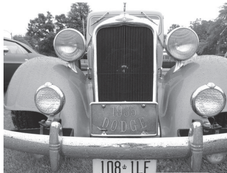
Photo - It is the 19th year for the annual car show in Espanola. This year promises plenty of shiny chrome, as well as charities and a craft show at The Oval beside the Espanola Regional Recreation Complex.

Espanola Premier Event Features Chrome, Leather, Crafts And Charities