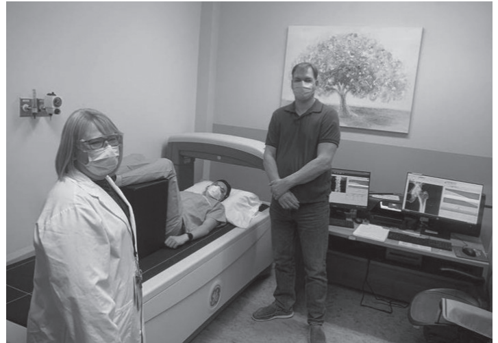
Photo - A demonstration of the bone mineral densitometer at NSHN. Zoom in to see clear medical imaging of bones, part of the process of testing for bone density.

Cameco has donated funds to the North Shore Health Network Foundation to purchase a piece of equipment to assist with bone assessment. According to the release, the equipment called a bone mineral densitometer that helps assess bone health and fracture risk will be installed at the Blind River network site but will serve all three local area health providers.