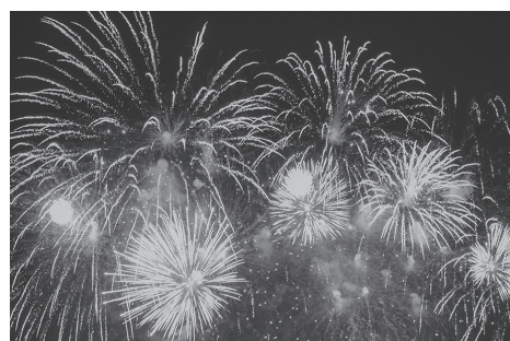
Photo - Webbwood will be the host community for the Canada Day fireworks display this year. The Township of Sables-Spanish Rivers is providing $2,000 towards this year's display.

The fireworks had been cancelled due to the pandemic, but return this year and the host community will be Webbwood.