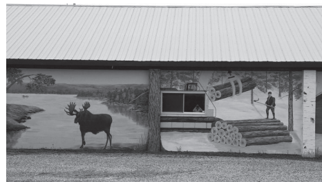
Photo: Roof repairs will be carried out on the Walford Community Centre by a Sudbury-based company.

Council has accepted a bid of $12,800 plus taxes to Just Roofing of Sudbury. The work is to be carried out in the immediate future.