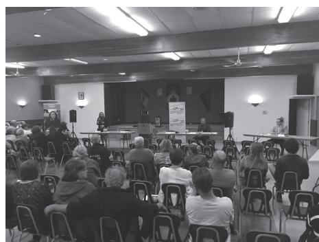
Photo - There were around 30 people who took in the local debate for the Algoma-Manitoulin riding in Espanola last Monday.