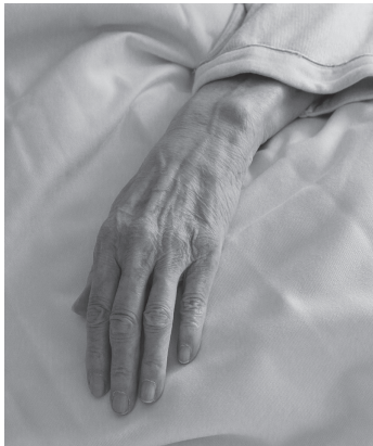
Photo: Thirty-two long-term care beds have been approved for two First Nations, 16 to be built in Massey for Sagamok-Anishnabek First Nation and 16 in Serpent River First Nation. The beds are being built under two separate applications partnered with St. Joseph General Hospital in Elliot Lake.

St. Joseph's General Hospital Elliot Lake along with Sagamok and Serpent River First Nations has received word that both their Campus of Care projects have been approved.