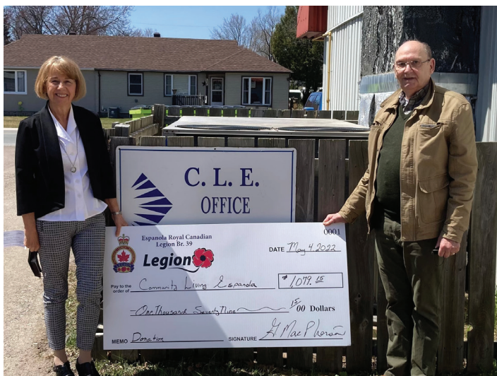
Photo - The Espanola Legion made a donation to Community Living Espanola of the proceeds of the meat rollofs, CLE is celebrating Community Living Month and appreciates the support of the Legion and the wider community.

The Espanola Royal Canadian Legion Branch #39 has donated to Community Living Espanola.