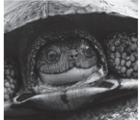
Photo - The fight to ban pit mining in Ontario continues, specifically in local areas where the Blanding's Turtle, an endangered species, could be affected.

In the end, council endorsed the ban and will forward the resolution to the Ontario government.