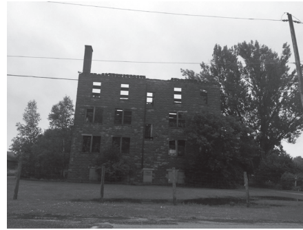
Photo: The ruins of one of the Spanish schools is still visible, but is on private property. The mouth of the Spanish River was the site for the joint boys' and girls' schools in Spanish, considered the largest in Canada, which operated from 1913 to 1965.

operated from 1913 to 1965, so what data is available is being correlated.