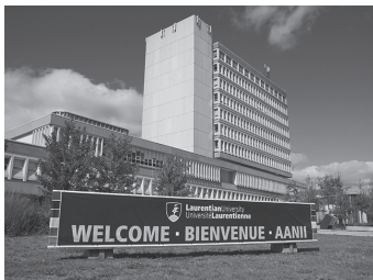
Photo - Laurentian University is seeking another extension in the bankruptcy process.