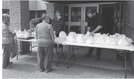
Photo - Seniors have been celebrated with take out lunches through the pandemic, but this year's celebration will be in-person, with swimming, displays, musical entertainment and lunch. Photo June 2021 by Rosalind Russell

By Rosalind Russell - The Town of Espanola is hosting a return to an in-person celebration of local seniors, an annual event held to thank the older citizens for their contributions to the community.