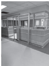
New nursing station