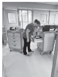
Getting things set up

The Manitoulin Health Centre (MHC) is a two-site small rural hospital serving the people of Mnidoo Mnising (Manitoulin Island). We are proud to operate on the traditional lands of the Anishinabek people. MHC is committed to ongoing action, awareness, and education that build on reconciliation efforts, and to work against anti-Indigenous racism. We honour the land and First Nations presence, practices, language, ceremonies and protocols.