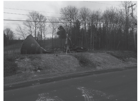
Photo: A long-time Espanola landmark is no more. The decades-old water tower located on Bass Lake Road has been torn down following the relocation of the local radio station transmitter and the installation of a new water main in Espanola. Contractors were hired to bring down the old tower using a cable system ensuring the safety of the crew. It had been used for many years as the location for the radio's transmitter, which has been moved to the grounds of Public Works.

Anyone driving down Bass Lake Road will notice a large landmark, the old water tower, is now gone.