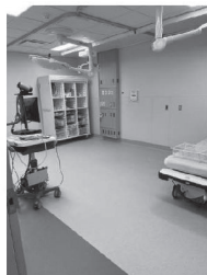
New trauma room