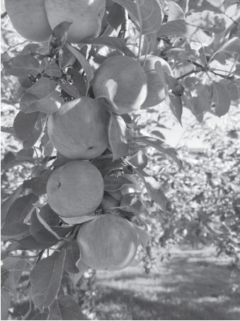
Photo: Nairn & Hyman Township wants their citizens to provide some comment about a community orchard. The deadline is December 2nd to comment.

By Rosalind Russell - The council in Nairn & Hyman Township is considering a community orchard in the township but is looking to the community for their support