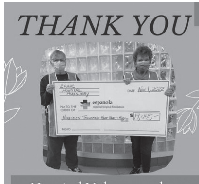
Photo: The Espanola Regional Hospital Auxiliary has helped out with the upcoming Radiothon to raise funds for the lab in the hospital. A cheque of $19,445 was handed over to the hospital foundation. The radiothon is set for Friday, December 2nd from 10:00 a.m. to 2:00 p.m.

The Moose 99.3 FM's annual Radiothon to raise funds for the Espanola Regional Hospital Foundation has nearly hit the one-third mark. When the partners announced