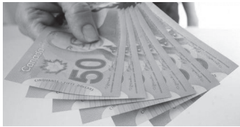
Photo: The federal government is increasing carbon tax payments for all Canadians.

By Rosalind Russell - You'll be getting a bit more from the federal government next year. The feds are raising Climate Action Incentive Payments to Canadians. In Ontario, single adults without children can expect