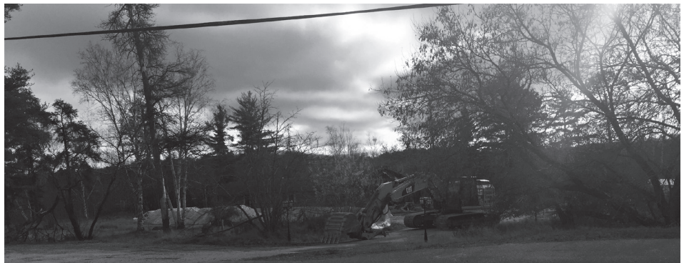
Photo: The Queensway Motel has been torn down to make way for a smaller motel complex, which will also include a six-store strip mall on the property according to site plans submitted in 2021. Photo by Rosalind Russell

A motel that served the Espanola area for decades has been torn down to make way for a new retail venture.