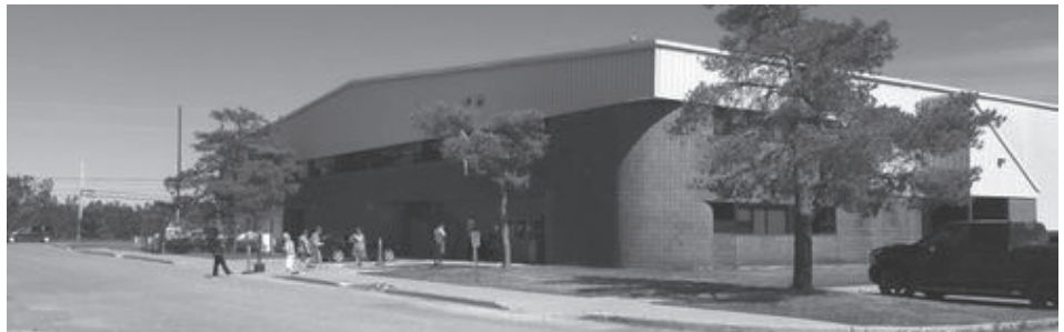
Photo: On Manitoulin Island, the Town of Northeastern Manitoulin and the Islands is receiving $319,114 to refurbish the Northeastern Manitoulin and the Islands Recreation Centre. The Northern Ontario Heritage Fund is providing $4.9 million to 24 different projects in the North, including the recreation centre.

By Rosalind Russell - The Northern Ontario Heritage Fund is providing $4.9 million to 24 different projects in the North.