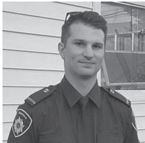
Photo: An Espanola man is heading up the The Second Annual Ruck 4 Remembrance March for Wounded Soldiers Canada. Anyone up for a great hike and raising pledges for the cause are welcome to take part. Photo provided by Courtemanche family.