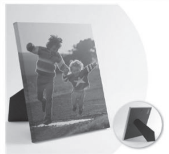
Hard Board Panels