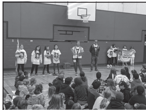
THANK YOU TO THE PUBLIC... Students and staff at AB Ellis PS would like to say thank you for all the support during their Terry Fox Walk this year...