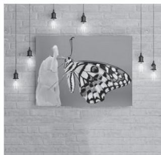
Metal Wall Prints