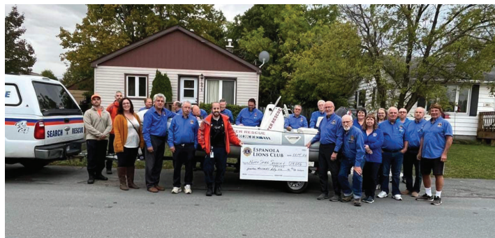
Photo: The Espanola Lions Club and the North Shore Search and Rescue partnered together to host the Canada Day Duck Race this year. The Lions handled the ticket sales and turned over $14,000 to the unit which went towards the new purchase of a vehicle and related equipment.

Espanola's Canada Day Duck Race sold out their tickets this year, thanks to the assistance of a local club.