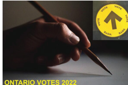
ONTARIO VOTES 2022

Photo - The election is very different this year. Many municipalities are moving to online or phone voting rather than voting in person. Check with your local municipality for their schedules.