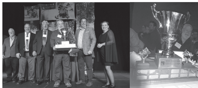
Photo: The Ontario Federation of Snowmobile Clubs held its AGM last weekend and presented the Spanish River Snowmobile Club with the Snowmobile Club of the Year Award.

Club with the Snowmobile Club of the Year Award. The club received the award recognizing its volunteers and the work that was carried out over the past year to not only enhance trails but also build bridges and even washroom facilities to ensure trail users of a great experience.