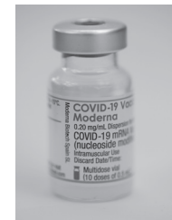
Photo: Public Health Sudbury & Districts says Moderna's new bivalent mRNA COVID-19 vaccine, which offers protection against COVID-19 infection and includes the Omicron variant, is now available.

Dr. Sutcliffe adds by September 26th, vaccine supplies will be sufficient to offer the bivalent booster vaccine to everyone aged 18 and older.