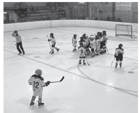
Photo - Two Espanola teams with the Espanola Minor Hockey League benefitted from supports from the local McDonald's franchise. McDonald's throughout the North Shore corridor supported 29 Under11 teams this hockey season.

In addition, the winner of the Golden Jersey, awarded to the player who epitomizes teamwork and sportsmanship in each game, was treated to a free meal in their local restaurant.