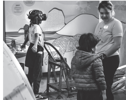
Photo - The Igloo installation in the exhibition is an original creation by the National Film Board, directed by Dan Thornhill, designed to bring to life the richness of Canadian Inuit culture. For more information, visit NFB.ca/Unikkausivut .

sense of pride among First Nation, Inuit and Métis communities with Serpent River being one of 20 communities in Northern Ontario hosting the show.