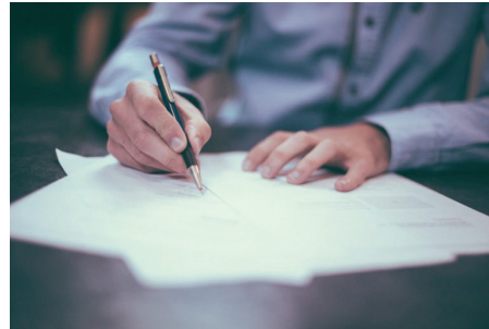
Photo - The LaCloche communities have completed a community safety and wellbeing plan. Part of that plan focuses on a regional transportation system for seniors and those who need medical care. A survey will detail how such a service can assist individuals in the four municipalities.