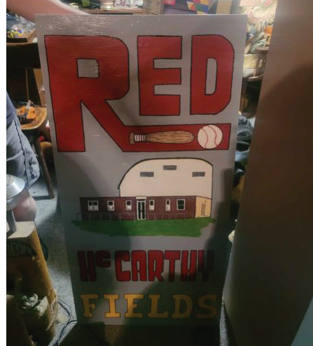
Photo - Are you ready to play ball? Sign up now for Espanola's biggest ball tourney. Photo of signage made by Joseph R. Noble supplied.

By Rosalind Russell - Espanola's Annual Mixed Slo-Pitch Tournament is now taking registrations.