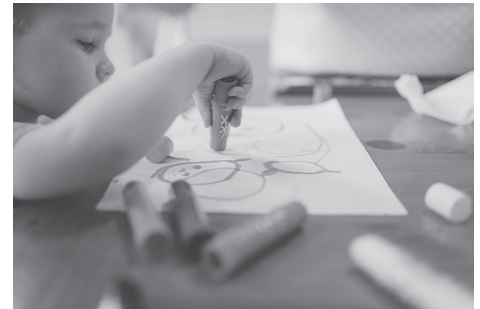
Photo: A summer program is available for the little ones to get ready for school in the fall. Our Children Our Future LaCloche is offering the free program.

The Our Children, Our Future LaCloche organization is offering a summer program for parents and their children planning to attend school this September. The nine-week school readiness program will be offered through July and August every Wednesday from 1:30 pm to 3:30 pm at the Early On Centre in Espanola. Parents are welcome to attend with their children with the program focusing on encouraging children's exploration, and early learning developmental education. Registering for the program is required. To register, call 705-869-5545 or send a message via social media @ OCOF LaCloche.