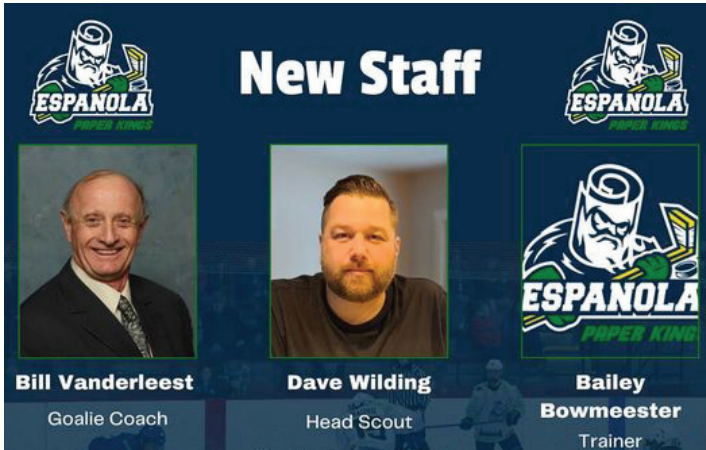
Photo - The Espanola Junior A Paper Kings are prepping for the next season. There is new staff, a hockey school in the works and season tickets are already on sale.

Three new staffers have been hired as part of the Paper Kings, the Junior A team in Espanola.