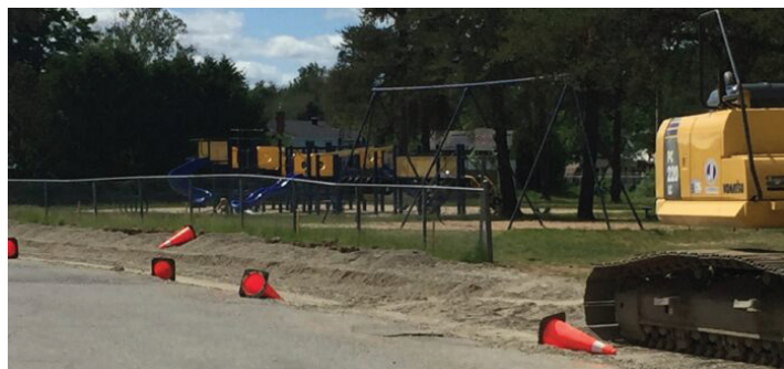
Photo: Espanola's newest recreation facility will be ready within the next two weeks with a grand opening set for June 29th.

Espanola's latest recreation attraction is nearly ready to go.