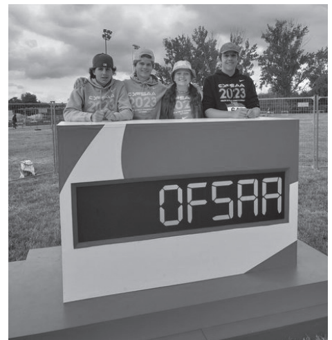
Photo: Four Espanola High School Spartans, athletes all, took in the Ontario finals in track and field, the highest level of competition at the high school level.