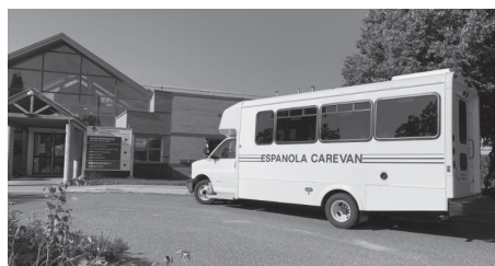
Photo - Espanola's Town Clerk says the municipality is pleased to receive some funding from Ontario for its public transit, but the big focus is on regional transportation with its neighbouring municipalities.

By Rosalind Russell - The Town of Espanola is receiving some funding from the Ontario government for public transit, but Espanola's Town Clerk says the big focus is now on a regional transportation option with its LaCloche Foothills Association municipalities.