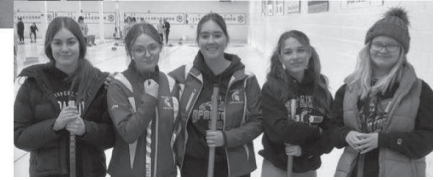
Photo - Both curling teams from Espanola High School are off to the NOSSA finals.