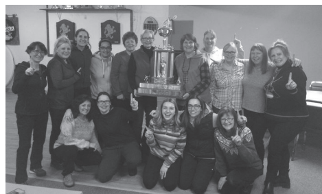
Photo - It's the 40th year for the Jacklin Cup and Espanola's ladies have brought it home once again.

It's a win for the ladies of the Espanola Curling Club.