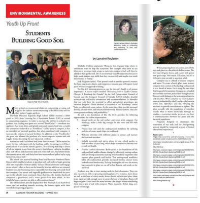
Photo - Espanola High is considered a Platinum level eco school, and a boost from a national publication, the Canadian Teacher Magazine, will help it maintain that status. The eco-friendly recycling of waste in the cafeteria has gained national attention. Photo provided.

Espanola High School's Eco Green Team is getting some national attention for its ecological efforts.