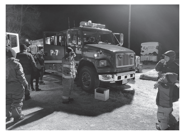
Photo - Residents of Beaver Lake were out in full force to voice their concerns about the City of Greater Sudbury considering shutting down their local fire hall. The Beaver Lake Firefighters are a small contingent of volunteers who provide their services, both at fires and the community at large. Photo – Beaver Lake Firefighters

The fire hall in Beaver Lake was packed as residents from the area came out to hear from the City of Greater Sudbury and its fire chief over possible changes under the city's modernization plan, which includes closing the hall and having fire services provided through Whitefish.