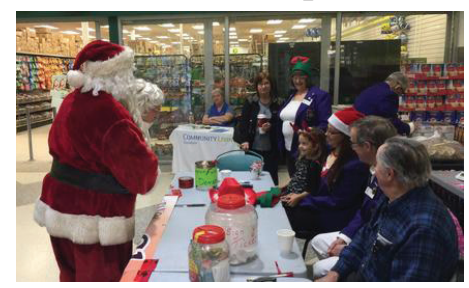
Photo: The Espanola Elks and the Moose 99.3FM - CJJM has teamed up once again to host the fundraiser for hampers for the Christmas season.