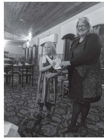
Photo - Massey Agricultural Society members, supporters and fairgoers took in the awards night honouring those who contributed to the 2023 Fair on Saturday evening at Waterfalls Lodge.

A group of Massey Agricultural Society members and supporters gathered at the Waterfalls Lodge to celebrate accomplishments from this year's Massey Fair.