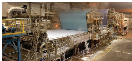
Photo - The last bale comes off line four at the Domtar Pulp and Paper Mill in Espanola.