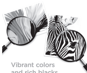
Vibrant colors and rich blacks