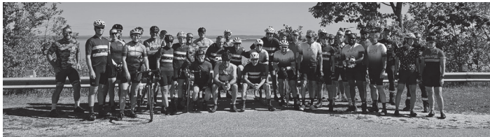
Photo: The Tour de Force is now dedicated to all fallen officers.