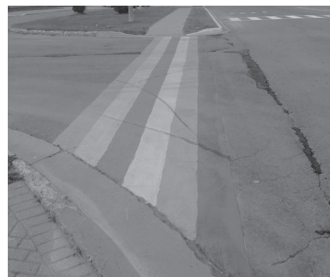
Photo: The Pride Cross Walk has been installed by the Town of Espanola to honour inclusivity in the community.

The town agreed to paint the cross walk to advocate for inclusivity in Espanola. With the success of the inaugural event, Espanola Pride is also looking forward to making the celebration an annual event.