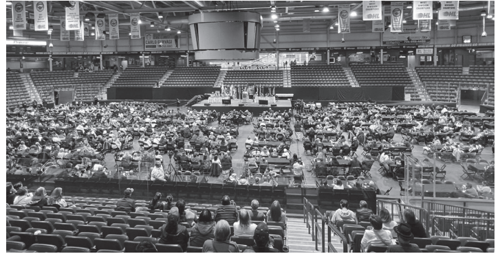
Photo: Hundreds of people from First Nations, part of the Robinson-Huron Treaty, gathered in Garden River last weekend to mark the anniversary of the treaty, but also to update members about the litigation involving the legislation.

Saturday, September 9th marked 173 years since the Robinson Huron Treaty was signed with a large gathering taking place in Sault Ste. Marie.