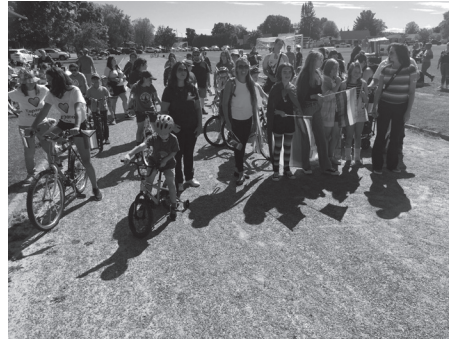
Photo - Espanola's Inaugural Pride Celebration was a tremendous success with over 600 people taking part in a Friday movie and Saturday full of games, crafts and activities throughout the day.

By Rosalind Russell - Espanola's Inaugural Pride Family Day was a success with nearly 600 people taking part.