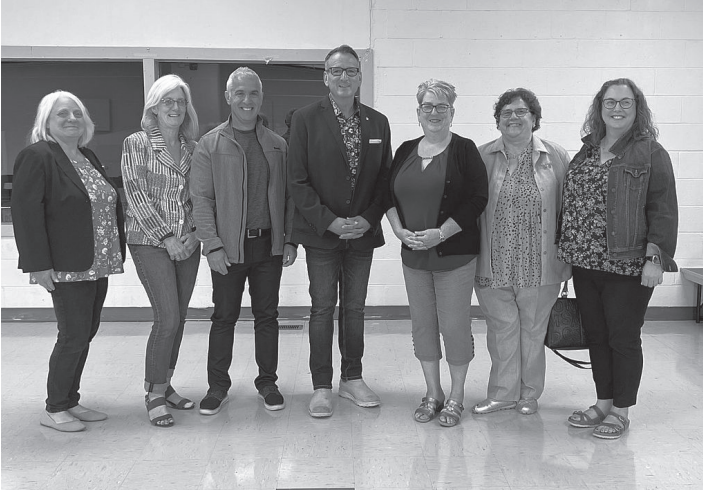
Photo: Northern Development Minister Greg Rickford was in Massey late last week to announce some major funding for Sables-Spanish Rivers Township, and the Spanish and Elliot Lake Legion branches.

The Ontario government is providing more than $666,000 through the Northern Ontario Heritage Fund Corporation to the Township of Sables-Spanish Rivers for three economic development projects.