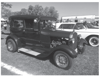
Photo - The Espanola Knight Cruisers Car Club 20th Annual Cruise-in & Craft Fair last year at the complex was a huge success, with well over a 1,000 people in attendance, nearly 200 cars, over 40 vendors, great demonstrations, it all added up to the best event ever! Organizers are hoping to see the same response this year. Photos By Rosalind Russell

By Rosalind Russell - Espanola council has given its approval for exemptions for the annual car show to be held late next month. Council provided three