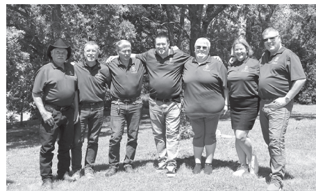
Photo - The Rolston Realty team are ready to meet all your needs when it comes to real estate, whether it is buying or selling property for a piece of land for a new build. Knowledgeable and available, they are there for you - they are Your Island Connection.