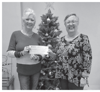
Photo - The Espanola Helping Hand Food Bank benefited from the Northern Credit Union fundraising campaign, receiving $3,000 in financial support.

Northern Credit Union's Christmas campaign contributed a total of $78,000 in monetary and in-kind